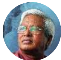
Sir Fazle Abed

Ashoka, which patiently, persistently pioneered the field of social entrepreneurship for decades, remains at its cutting edge. It has unleashed an unprecedented new force for good.