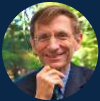
Bill Drayton CEO & Founder, Ashoka

There is no way the problems can continue to outrun the solutions when everyone is a changemaker.