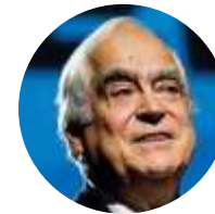
Peter Eigen Founder, Transparency International Ashoka Fellow (Germany)

Ashoka and the field of social entrepreneurship it built are giving millions the power of knowing they can change their worlds. Nothing undercuts corruption more effectively or more permanently.