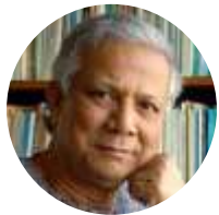
Dr. Muhammad Yunus Chairman, Grameen Bank 2006 Nobel Peace Prize Winner Ashoka Global Academy Member

Ashoka's ability to see the future that is here is an extraordinary power. It flows from its grasp of history and its ability to see the patterns in the big impact innovations of its thousands of leading social entrepreneurs across the planet.