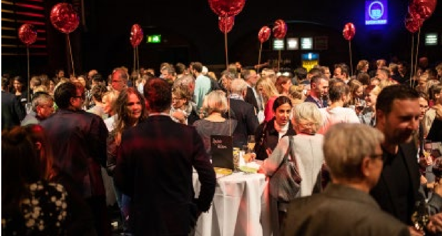
Ecosystem networking at the German Induction 2018

Ashoka was named #5 most influential NGO worldwide