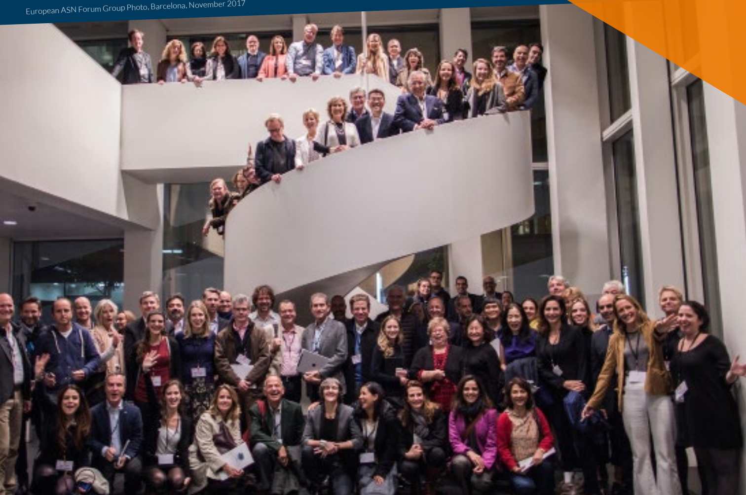
European ASN Forum Group Photo, Barcelona, November 2017