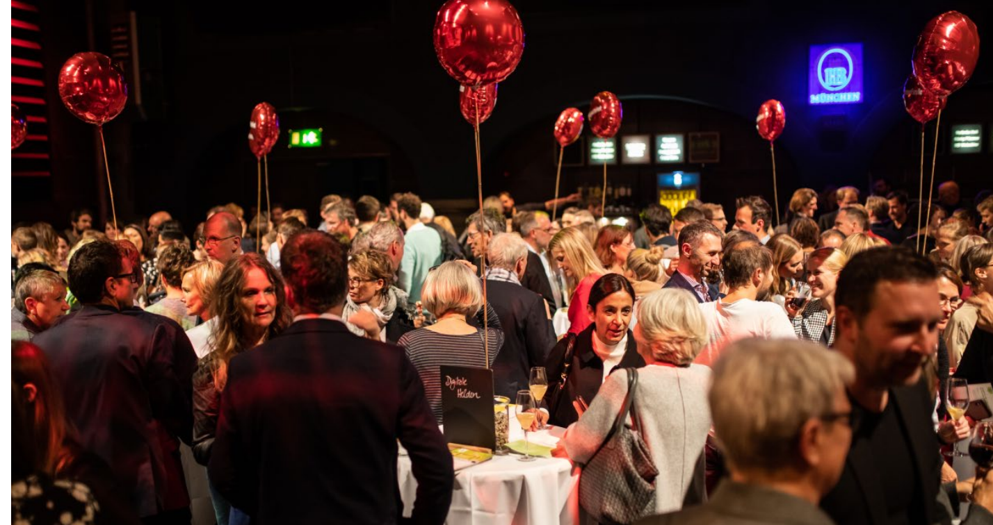
Ecosystem networking at the German Induction 2018

Ashoka is a living encyclopedia of social innovation in every field around the world