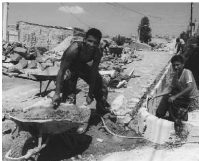
Street improvements in the Agua Fria settlement of northern Guadalajara where Ashoka and Cemex's Patrimonio Hoy program has speeded and cut the cost of housing.

Getting the for-profit finance industry to enter the social financial services field is entirely critical if the citizen sector is to obtain the inventive, adaptive, responsive, and efficient institutional services it so urgently needs. 12 Investor