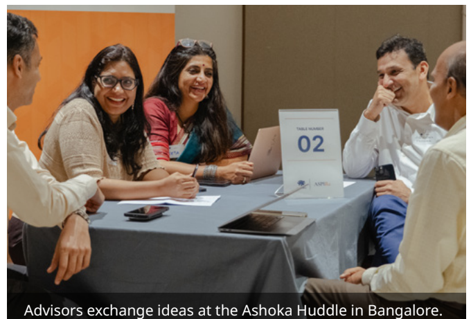
Advisors exchange ideas at the Ashoka Huddle in Bangalore.