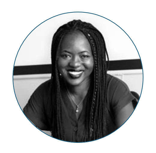
Regina Honu Soronku Solutions

A law firm whose only client is planet Earth. Using strategic litigation to challenge air pollution levels and fight climate change.