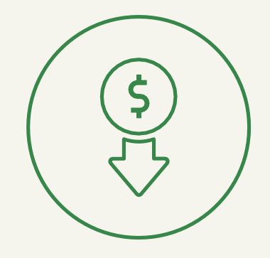
Cheap initial cost