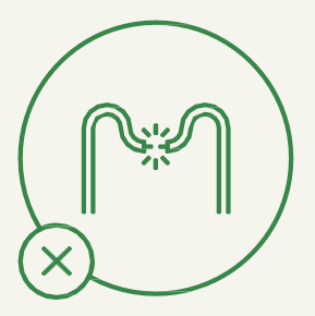
Low Quality Components