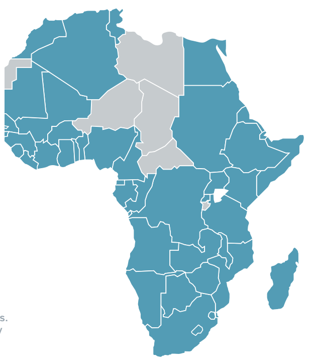
FIGURE C Future Forward Innovation Network by Sub-Region

Social entrepreneurs, program managers, and school leaders in over 43 countries have received awards or attended collaboration events dedicated to discovery and supporting transformative efforts for solving youth employment challenges. Models with notable scale and impact are cited more frequently from South Africa throughout the guide given Ashoka's first presence in Africa was in South Africa.