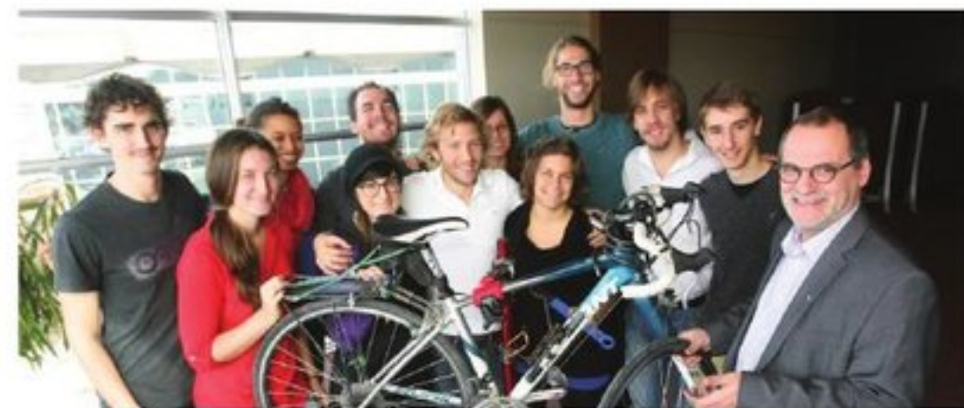
Students from the University of Sherbrooke pose with a bicycle to represent their Changemaker Challenge project La coop La Deraile a besoin de vous.

Ashoka partnered with universities across Canada to host a dozen Changemaker Showcases that introduced students and educators to stories of change. Through TED-style talks, students and leading innovators shared insights and stories that help redefine success for today's youth.