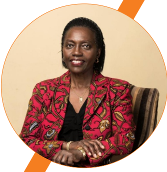
Hon. Martha Karua Advocate for Social Justice, former long-standing MP and Minister @MarthaKarua