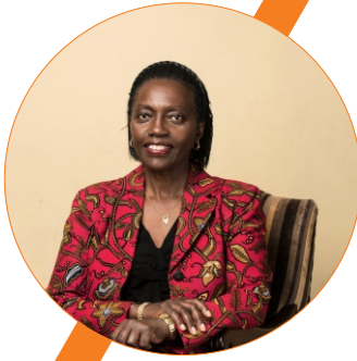
Hon. Martha Karua Advocate for Social Justice, former long-standing MP and Minister @MarthaKarua