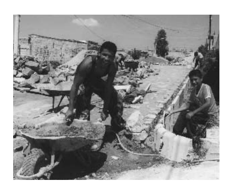
Street improvements in the Agua Fria settlement of northern Guadalajara where Ashoka and Cemex's Patrimonio Hoy program has speeded and cut the cost of housing.

Amanco will be the first into this market and should settle in long term with a significant share, even recognizing that competitors will follow. The company has established key relationships and is quickly coming up the learning curve to mastering this new market, which is making it harder and harder for others to catch up quickly.