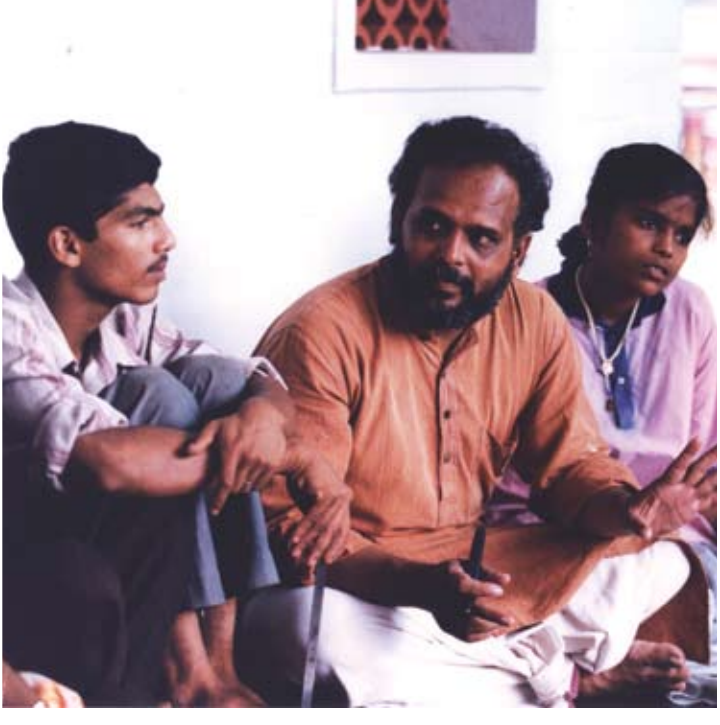
As published in the Winter 2006 edition of