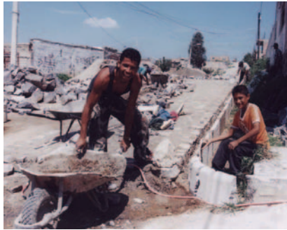
Street improvements in the Agua Fria settlement of northern Guadalajara where Ashoka and Cemex's Patrimonio Hoy program has speeded and cut the cost of housing.

Far bigger is the need to help the farmers obtain credit so they can buy this substantial capital asset. Loans to farmers for drip irrigation should be attractive to lenders for two reasons: (1) there is security and (2) the farmers will stop making many other payments long before this one, given how central this equipment is to their economics. Once the mechanisms are developed, such loans could quickly become a gigantic financial product class given that capital equipment and many millions of modest farms are involved.